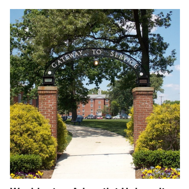
Washington Adventist University announced that it will offer to purchase the 14.5 acre property currently home to Adventist HealthCare's Washington Adventist Hospital, which will relocate to Silver Spring in August with a new name Adventist HealthCare White Oak Medical Center. The adjacent property will effectively double the size of the WAU campus. MORE